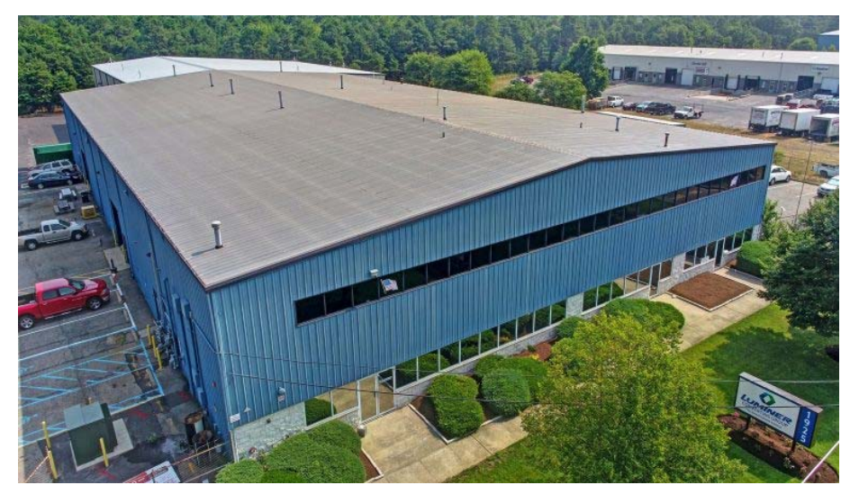
Luminer Facility in Lakewood. - LUMINER

Luminer, a labeling solutions provider, said Tuesday it completed an expansion of its primary manufacturing facility in Lakewood — adding 20,000 square feet of multi-purpose space, bringing the plant's total square footage to 50,000.